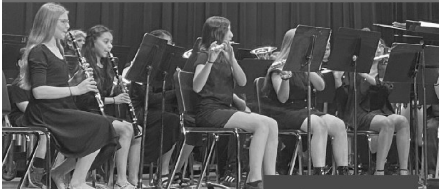
Pictured: members of the 6th grade band